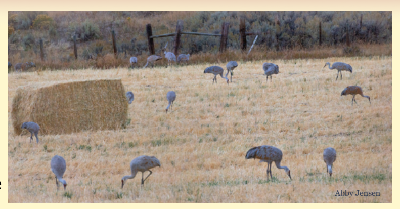
Cranes using a Crops for Cranes field

Our Crops for Cranes program, initiated in 2015, is an on-the-ground, habitat improvement program that works with ranchers, farmers, private land owners, and conservation organizations to leave grain crops for Sandhill Cranes during the fall when the cranes gather or "stage". The Sandhill Cranes that stage in the Yampa Valley, especially the young of the year, rely on waste grain crops to provide adequate nutrition for successful migration to their wintering grounds.