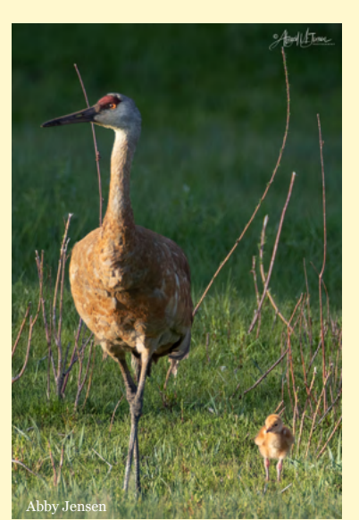
Athena and chick - the Nest Camera crane family

Over the past 10 years, Colorado Crane Conservation Coalition (CCCC) has greatly expanded its programs in support of our mission of protecting and conserving Rocky Mountain Greater Sandhill Cranes and their habitat through education and science. Our annual Yampa Valley Crane Festival continues to grow in number of participants and events and in its impact on public awareness of the threats that cranes face today. In addition to the four day festival, hundreds of children and adults have gained a better understanding and appreciation of this iconic species through our school, camp and community education programs, through our numerous contests, and through our webinars. Our Crops for Cranes program has expanded every year since 2015 and provides needed nutrition for cranes in Northwest Colorado during the staging season. Our Crane Nest Camera has added to the scientific knowledge