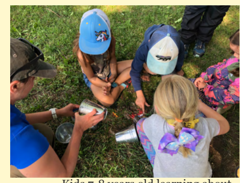
Kids 7-8 years old learning about how cranes raise chicks

Additionally, CCCC coordinated a high school field trip with a Steamboat Springs science teacher to view Sandhill Cranes on their staging area near Hayden, Colorado. We brought over 100 freshman and sophomore biology students into the field to learn about crane behaviors and physical characteristics while observing live cranes in their natural habitat.