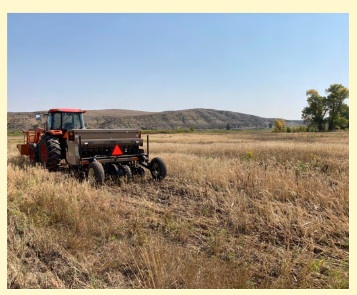
Organic wheat being planted at Yampa River State Wildlife Area

However, the production of local grain crops (wheat, oats, and barley) has decreased significantly in the Yampa Valley over the last 50 years. This has resulted in reduced food supplies available to the cranes during fall staging. Recent research highlights the importance of agricultural grain crops in close proximity to roosting areas (such as the Yampa River) for Sandhill Cranes during fall staging and migration.